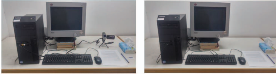
Figure 1. The experimental room in the camera condition (left) and in the no-camera condition (right). See the online article for the color version of this figure.

for the following three reasons that we did not anticipate in advance in the preregistered plan: (v) Four participants suspected the cover story of video recording (two in the no-camera condition who asked whether they were being recorded, and two in the camera condition who mentioned to the experimenter that the camera does not work or is not directed toward them); (vi) two participants did not agree to use the pen as instructed during the experiment proper (one insisted on using his own pen, and one wrapped the supplied pen with paper tissue); and (vii) two participants could not be included in the analysis because the experimenter neglected to record their experimental condition. Consequently, the effective sample size was 40–43 participants in each condition. 5 The Appendix contains a series of analyses that examine the sensitivity of our findings to the different criteria. Briefly, the main findings are robust to the exclusion criteria we use. In fact, the pattern of findings holds even when we include all of the participants in the analysis.